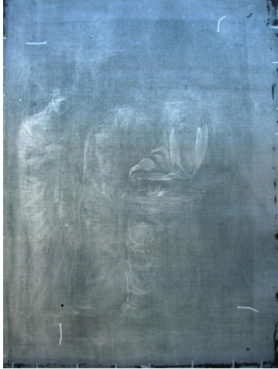
Fig. 4. X-ray image in which alleged signature is not visible nor wrinkles and defects on the upper third sector.

Therefore, we can conclude that the THz images provide complementary information to X-ray images and optical inspection because it can unveil features (hidden sketches and signatures, wrinkles, stroke style, etc.) that cannot be evaluated otherwise. Such features can support evaluation studies of paintings in relation to authorship authentication, structural integrity assessment and restoration needs. Besides the use of THz technology to analyze the structural properties of the paintings, THz technology has also the potential to study the chemical composition of the painting by analyzing the information provided by the waveform in the frequency-domain. This type of spectroscopy report requires the creation of a pigment spectroscopy database and proper calibration protocol that are outside of the scope of this paper.