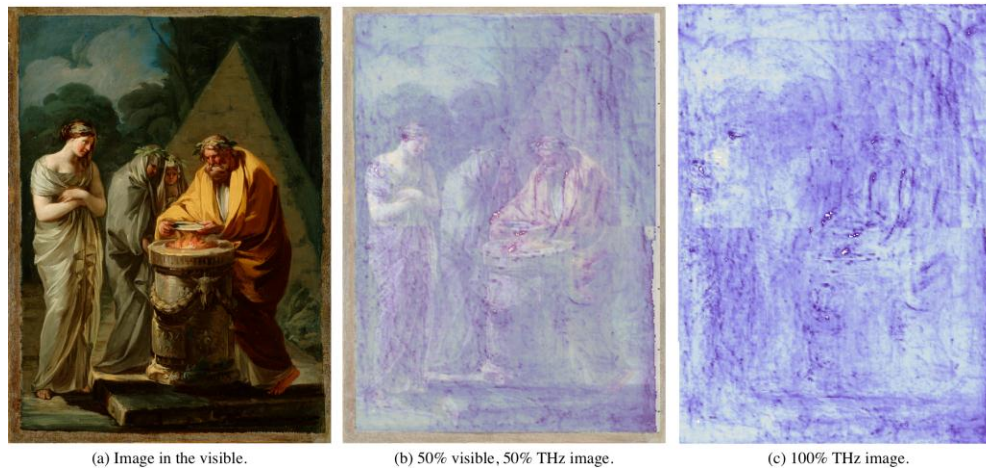
Fig. 2. Composition of “Sacrifice to Vesta” at different transparency levels of visible and THz images.

Fig. 2b shows a superposition of 50% visible 50% THz, and Fig. 2c corresponds to a 100% THz image with no visible image superposition. The difference in reflectivity in areas of the painting is associated to the reflectivity of the pigments. This different reflectivity could be related with the metal content of the pigment. For instance, pigments with metallic content would show a stronger THz reflectivity than pigments with no metallic content.